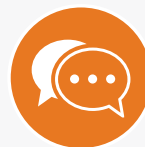
BOTIUM BOX Chatbot Testing & Assurance