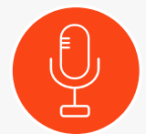
LIVEVQ Voice Quality Assurance