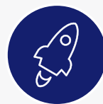
VELOCITY Functional & Regression Testing

The award-winning Cyara Automated CX Assurance Platform enables companies to deliver better CX with less effort, cost, time, and risk. Cyara supports the entire CX software development lifecycle, from design to functional and regression testing, load testing, and production monitoring, ensuring enterprises can build flawless customer journeys across voice and digital channels.