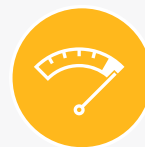
CRUNCHER Performance Testing